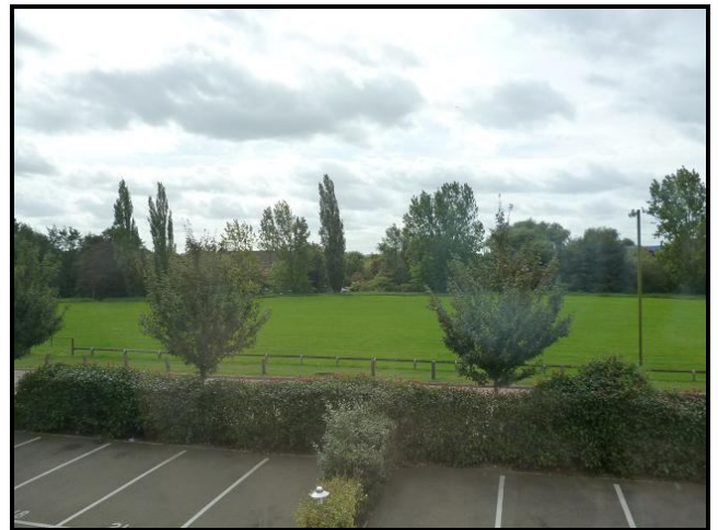
(View to front)

One numbered parking space plus additional visitor parking.